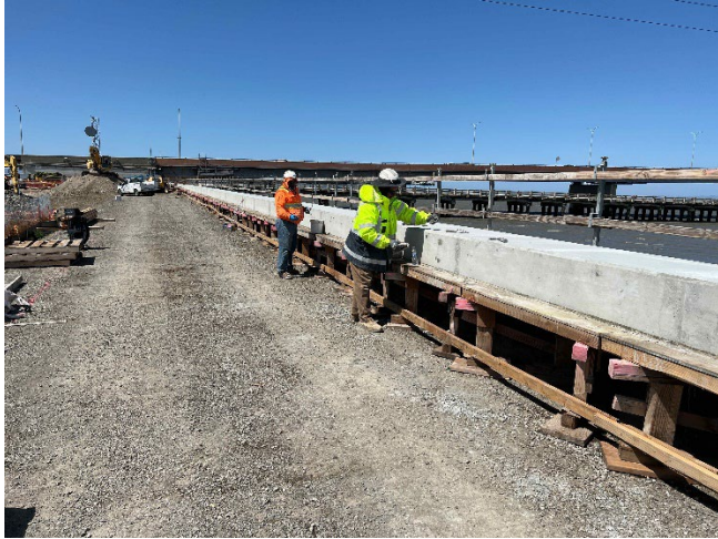
Dry finishing of concrete cap along Floodwall 12 near Sta. 110+00 (near Bridgeview Park)