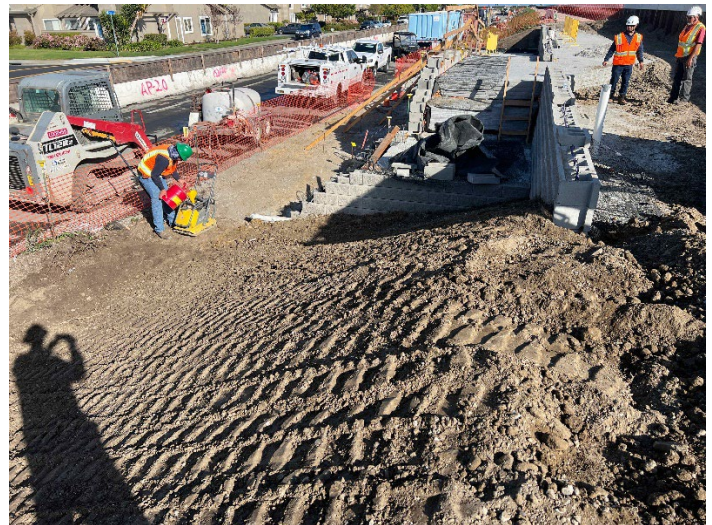
Grading work near Access Point 20 retaining walls along Beach Park Blvd in Phase II