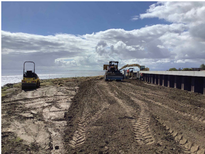
Bayside grading work at Access Point 18 along Beach Park Blvd in Phase II