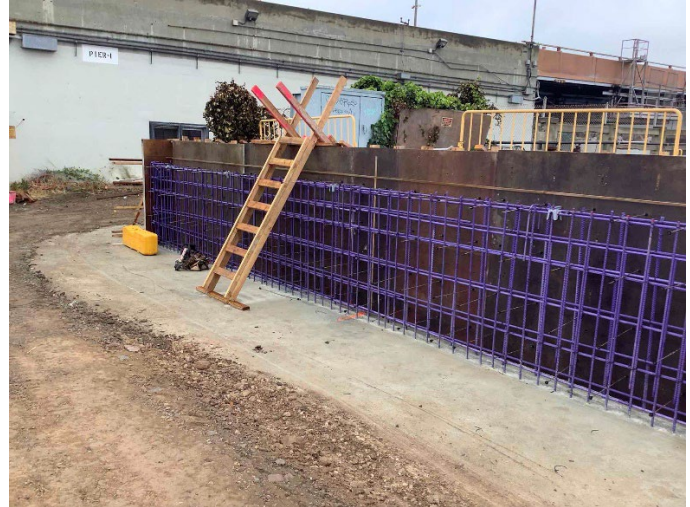
Rebar and formwork placement for Floodwall 11 near Sta. 102+00 (adjacent to Werder Pier)