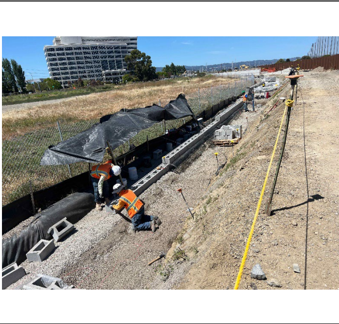
Retaining Wall 01 block placement near Baywinds Park in Phase III.