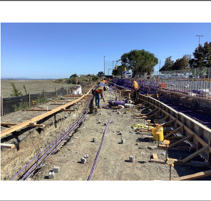
Rebar and formwork placement for Floodwall 2 near Mariner's Point Golf Center in Phase III.