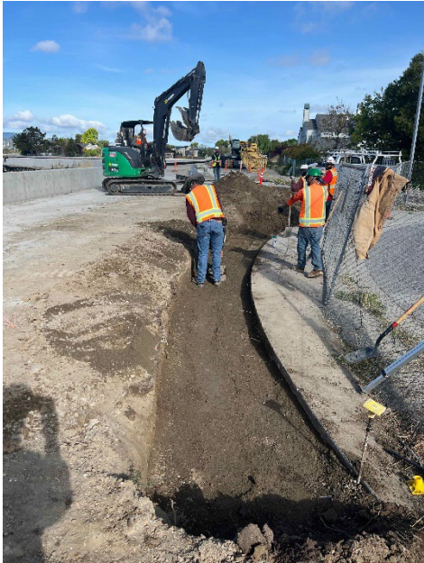
Retaining Wall 37 construction near the Baffin Street Bridge in Phase I.