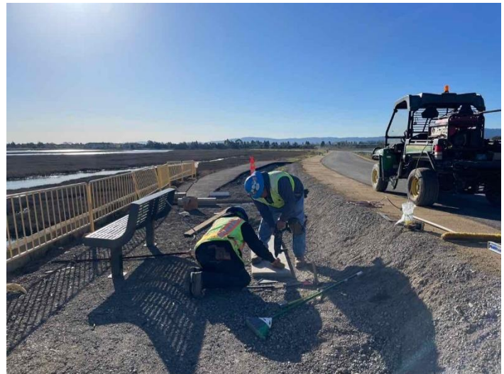
Site furnishings installation near Sea Cloud Park