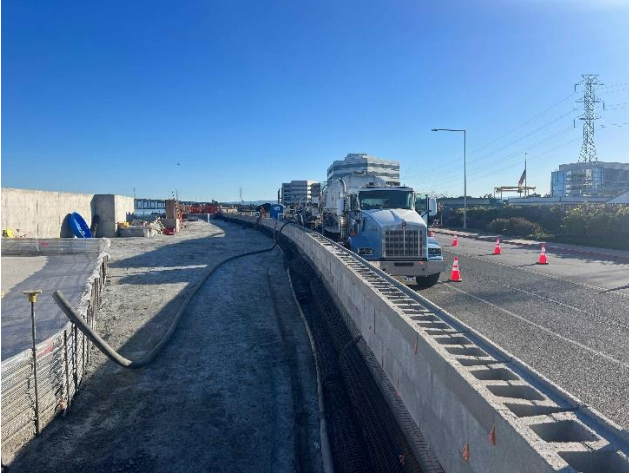
Lightweight Concrete Fill at Floodwall 7 near E. Third Ave