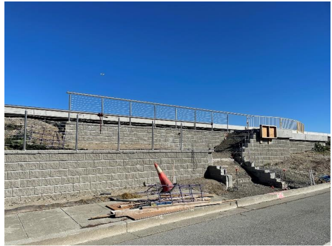
Guardrail installation at AP 15 along Beach Park Blvd