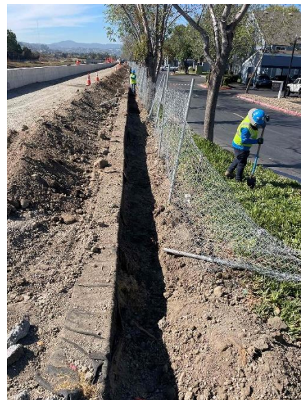
Irrigation installation along the trail edge south of Gateshead Park