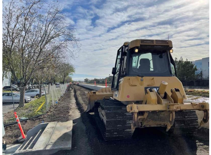
Fine grading operations south of Sea Cloud Park