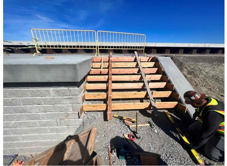
Forming of Access Point staircases along Beach Park Blvd