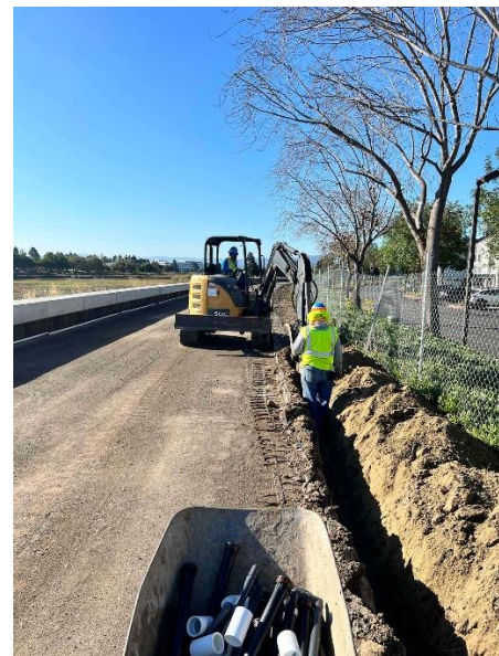
Irrigation installation along the trail edge south of Sea Cloud Park.