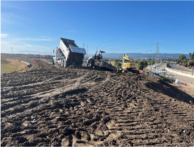
Earthen fill operations at Access Point 25 north of Shorebird Park