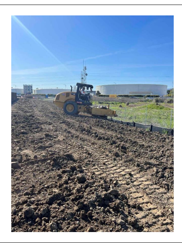
Earthen fill near AP 6 near East 3<sup>rd</sup> Ave