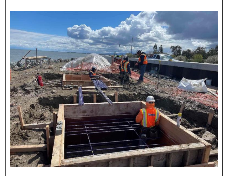
Rebar and formwork for the shade structure foundations along Beach Park Blvd near AP 17