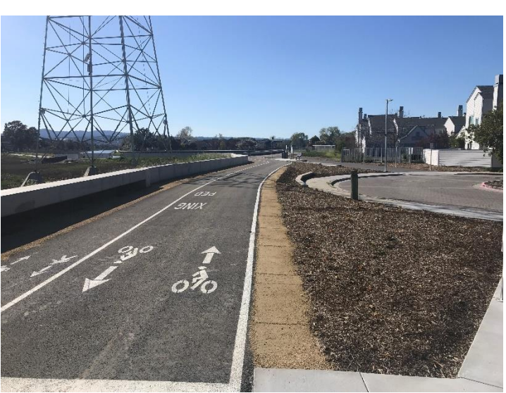
Removal of trail closure fencing near AP 38 Baffin Court