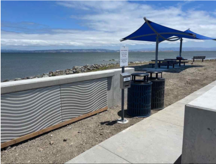
Site furnishings installed at Access Point 17