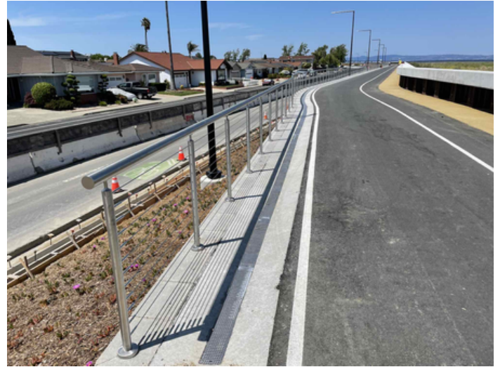
Trench Drain and Railing being worked on at Retaining Wall 30 and Retaining Wall 29