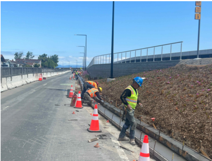
Curb and Gutter Placement at Section 19