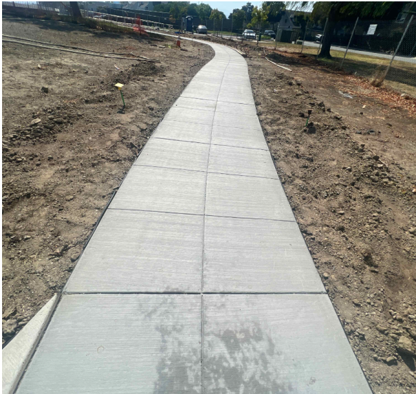
Gateshead Park Restoration