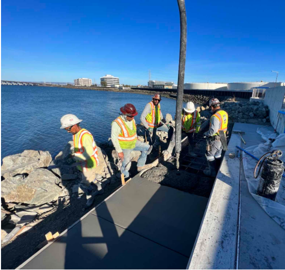
Bayside Path Concrete Placement North of the SM Bridge