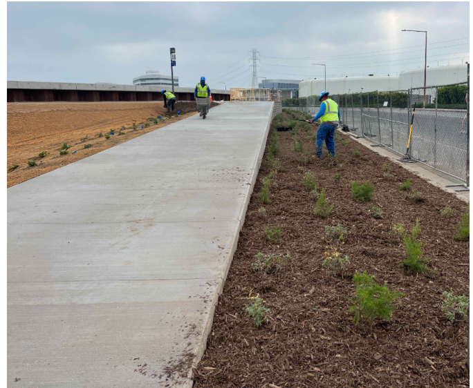
Access Point No. 6 Landscaping