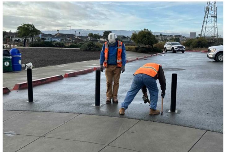
Bridgeview Park Restoration / Punch List Work