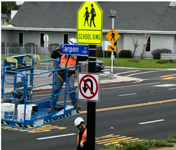
Beach Park Blvd Punch List Work - Street Sign Installation