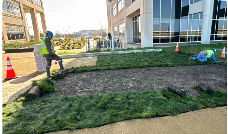
AP-9 Sod Replacement