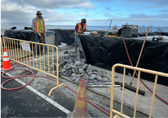
AP-4 Punch List Work